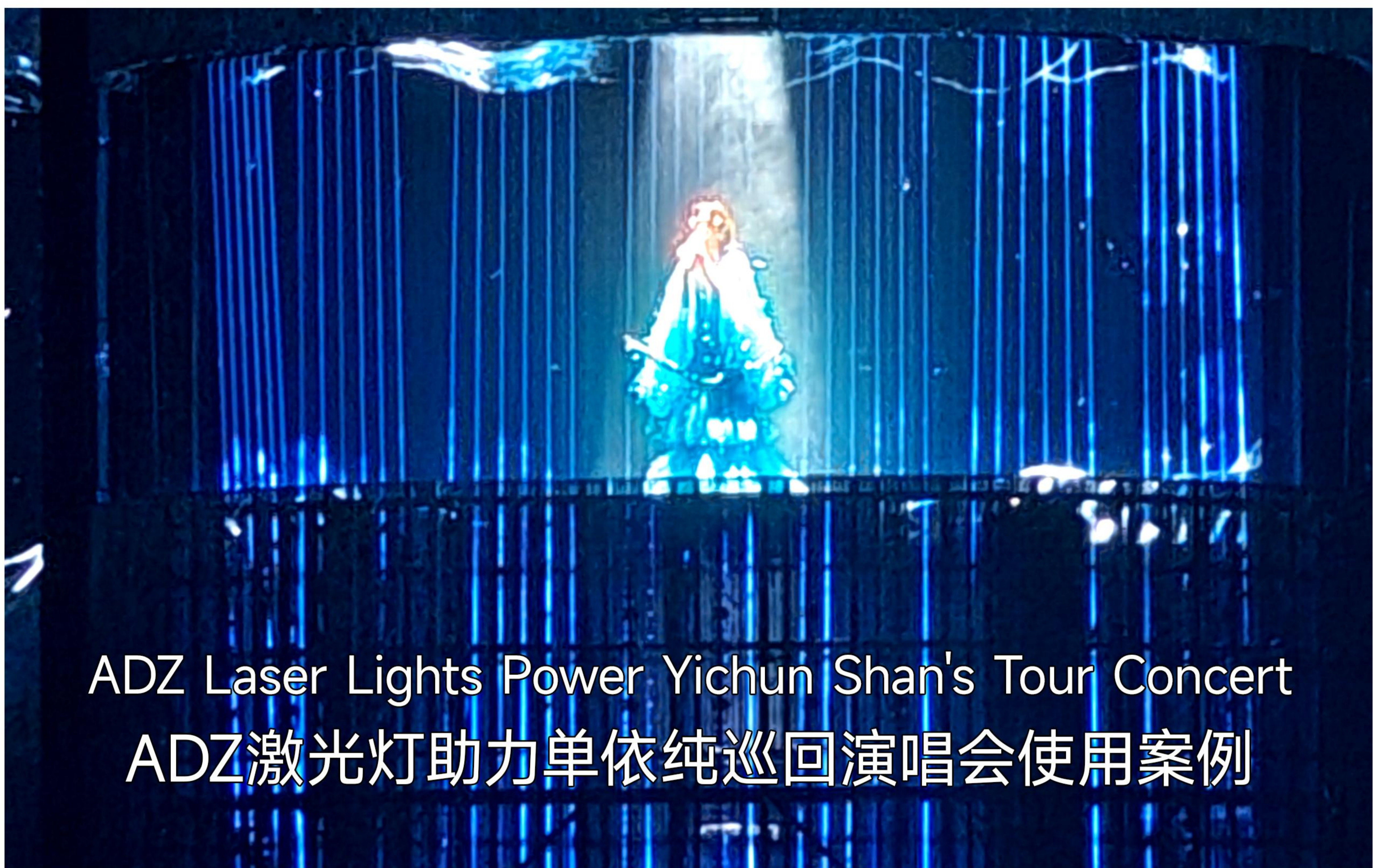
ADZ Laser Lights Power Yichun Shan's Tour Concert ADZ激光灯助力单依纯巡回演唱会使用案例